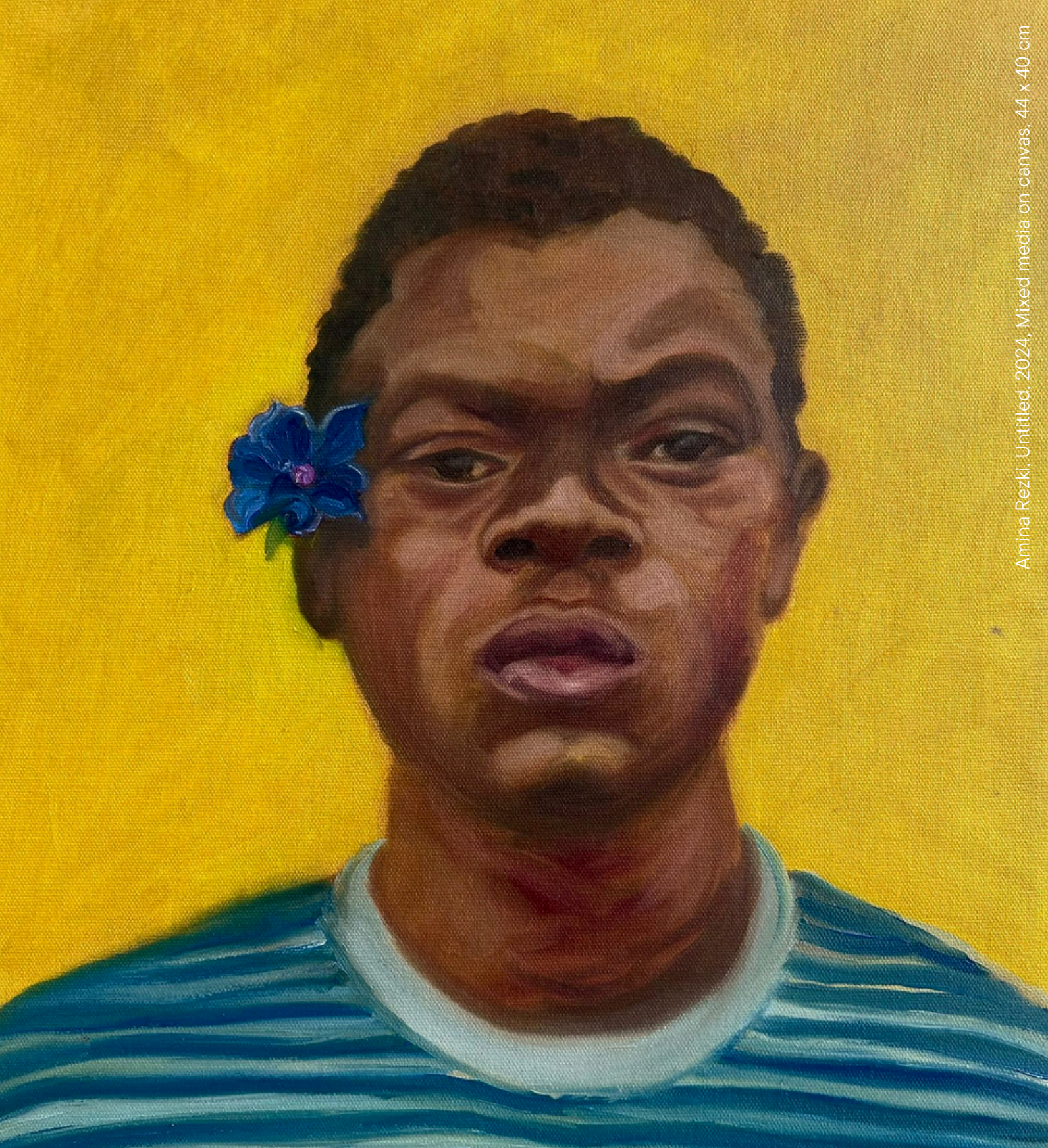
Amina Rezki, Untitled, 2024, Mixed media on canvas, 44 x 40 cm