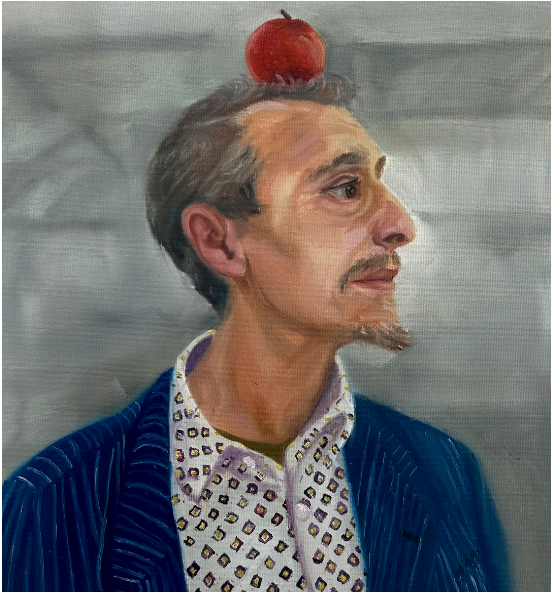
Amina Rezki, Untitled, 2024, Mixed media on canvas, 44 x 40 cm