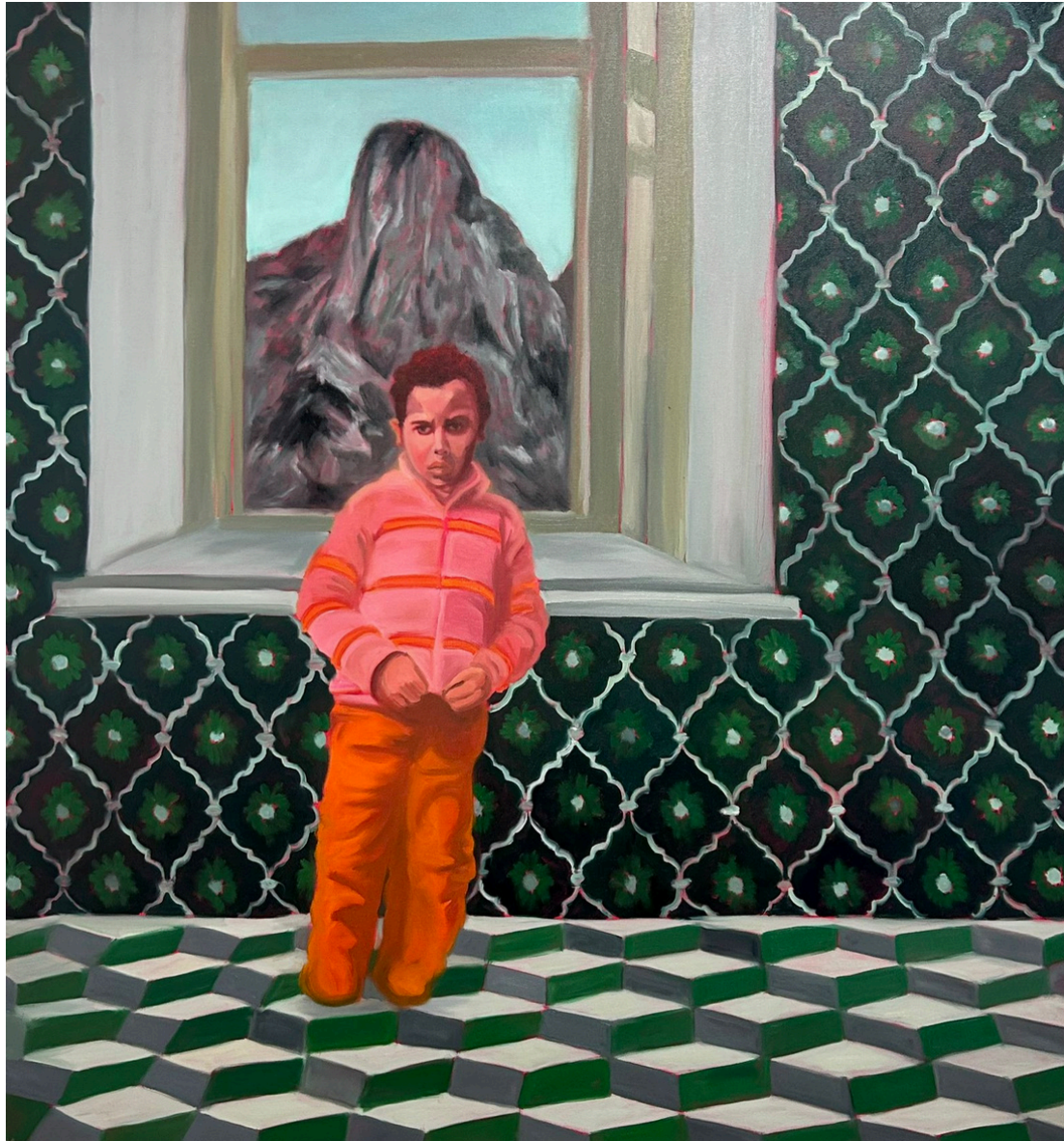
Amina Rezki, Untitled, 2024, Mixed media on canvas, 120 x 157 cm