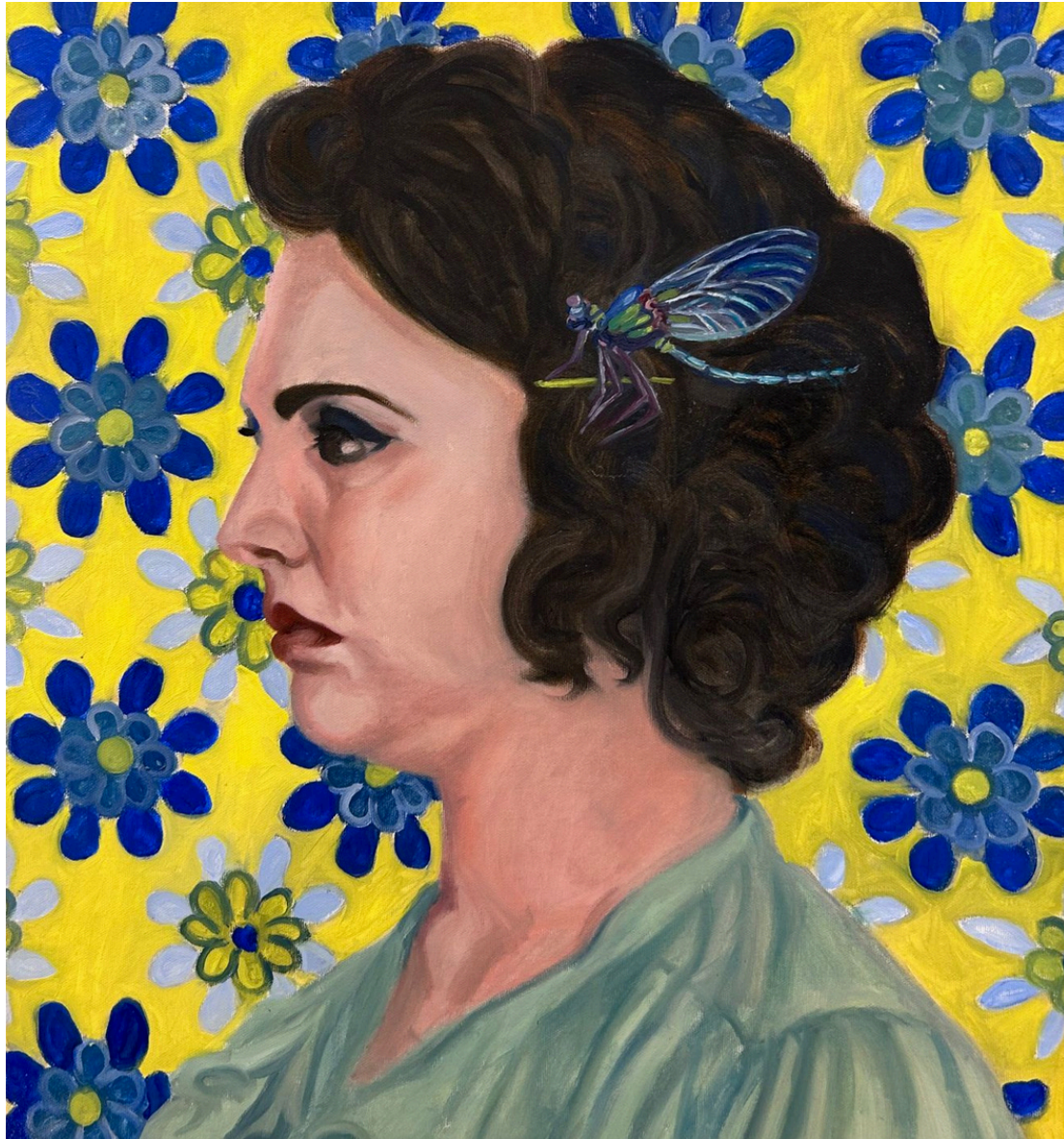
Amina Rezki, Untitled, 2023, Mixed media on canvas, 65 x 53 cm