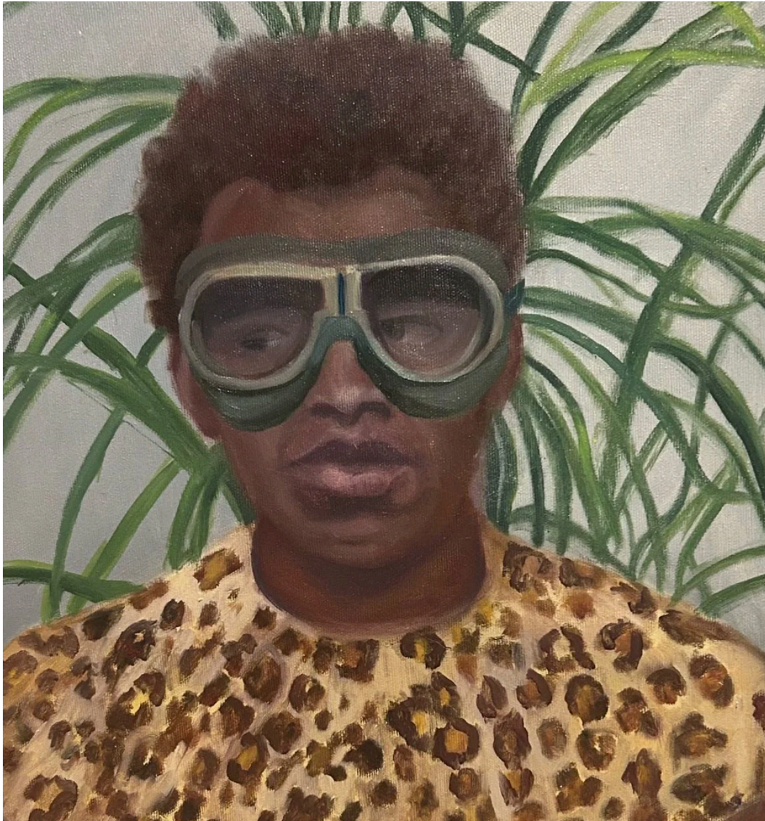
Amina Rezki, Untitled, 2024, Mixed media on canvas, 50 x 40 cm