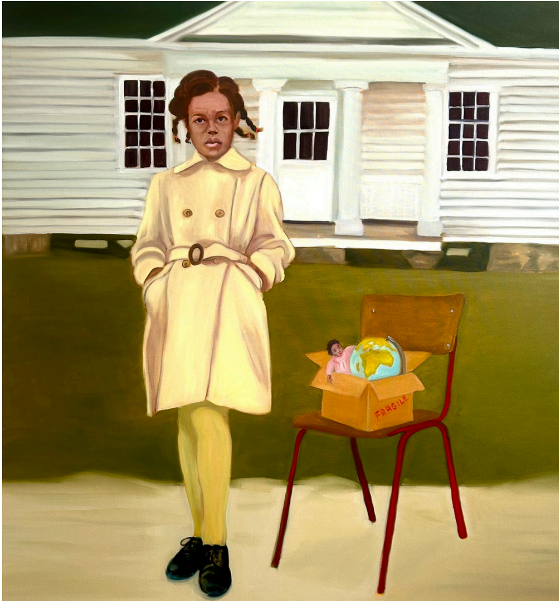
Amina Rezki, Untitled, 2024, Mixed media on canvas, 130 x 160 cm