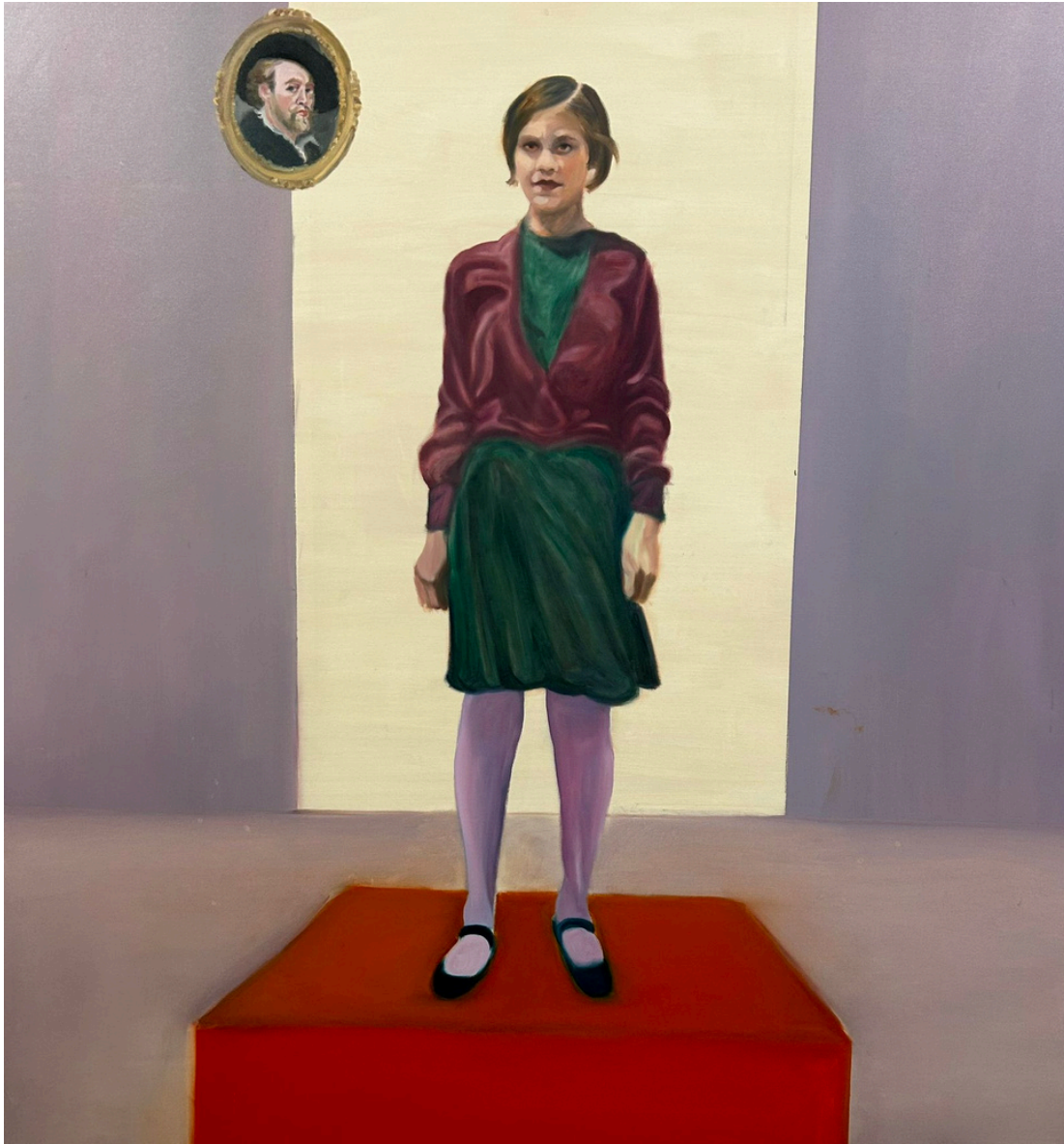
Amina Rezki, Untitled, 2024, Mixed media on canvas, 190 x 160 cm