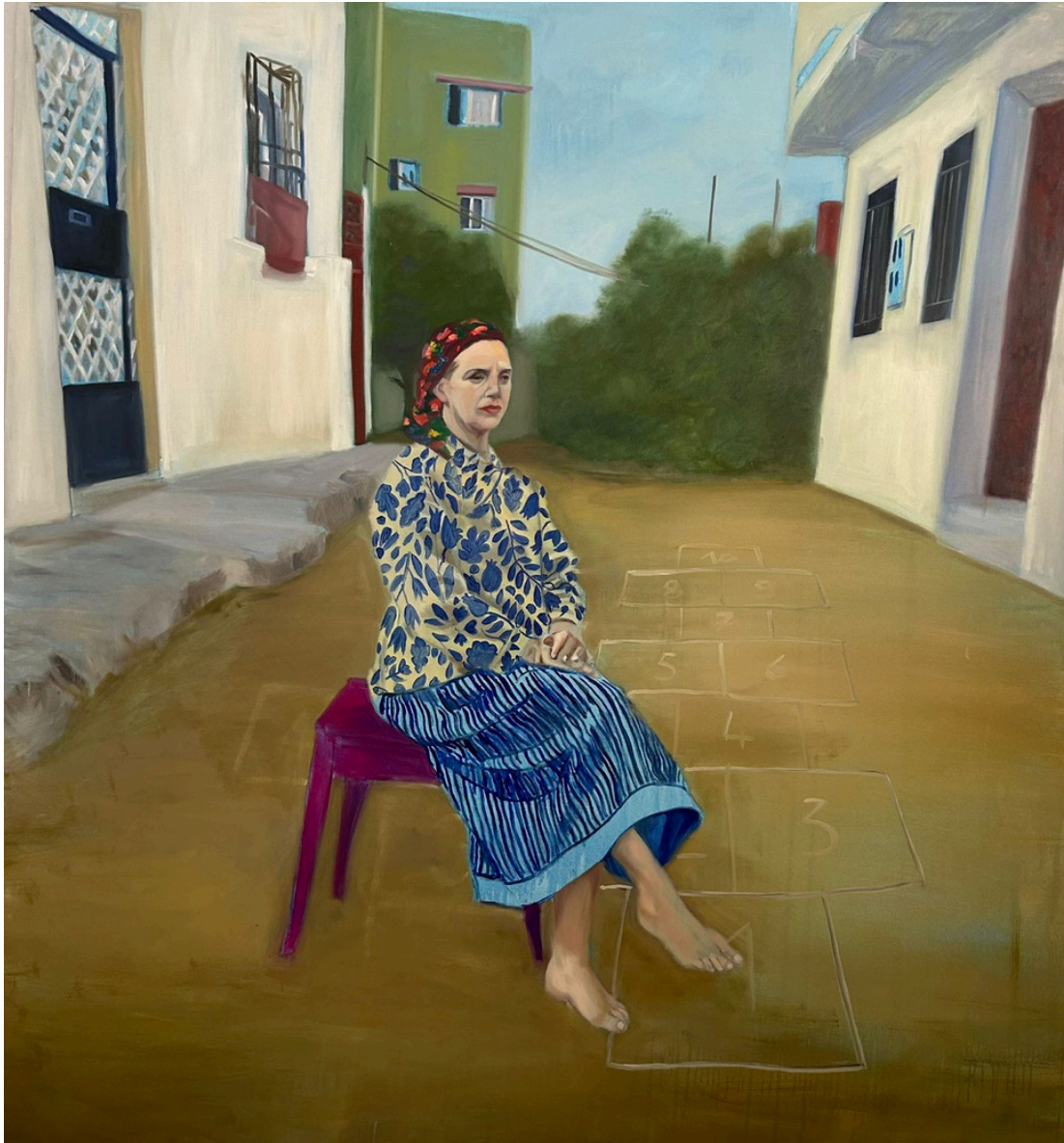
Amina Rezki, Untitled, 2024, Mixed media on canvas, 190 x 160 cm