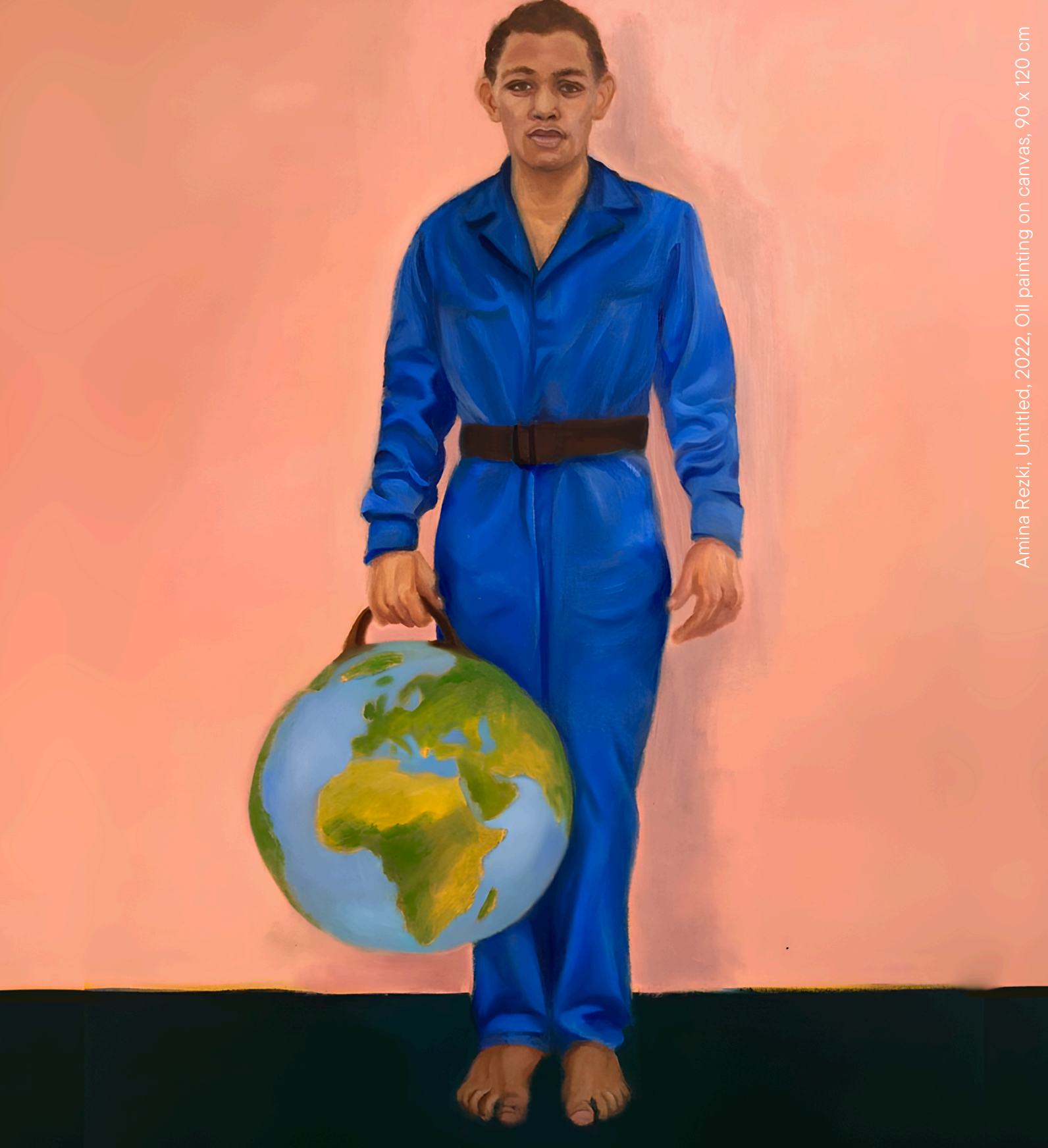
Amina Rezki, Untitled, 2022, Oil painting on canvas, 90 x 120 cm