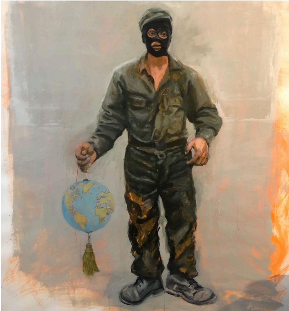
Amina Rezki, Untitled, 2020, Mixed media on canvas, 146 x 132 cm