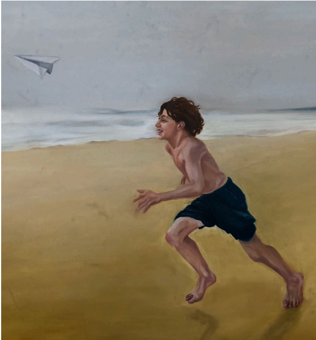
Amina Rezki, Untitled, 2024, Mixed media on canvas, 90 x 116 cm