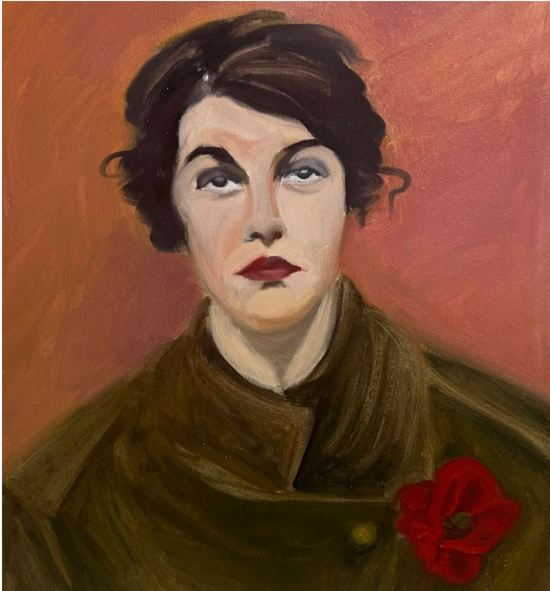
Amina Rezki, Untitled, 2024, Mixed media on canvas, 50 x 40 cm