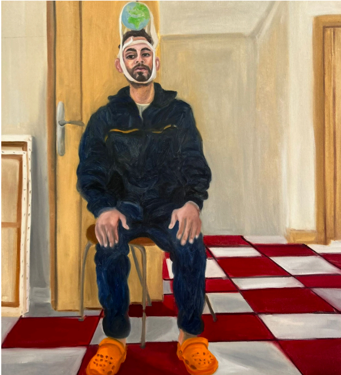
Amina Rezki, Untitled, 2023, Mixed media on canvas, 116 x 81 cm