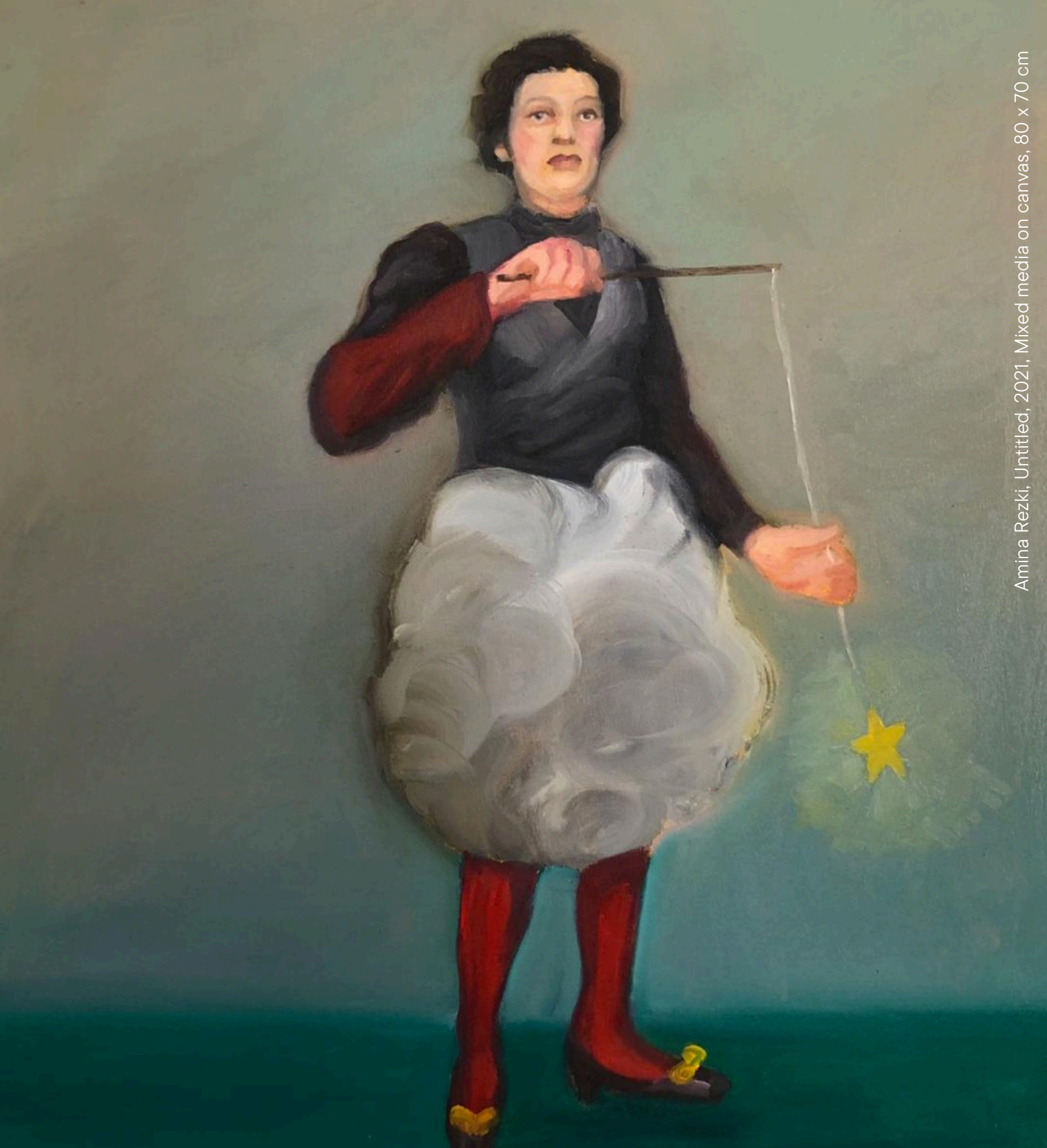
Amina Rezki, Untitled, 2021, Mixed media on canvas, 80 x 70 cm