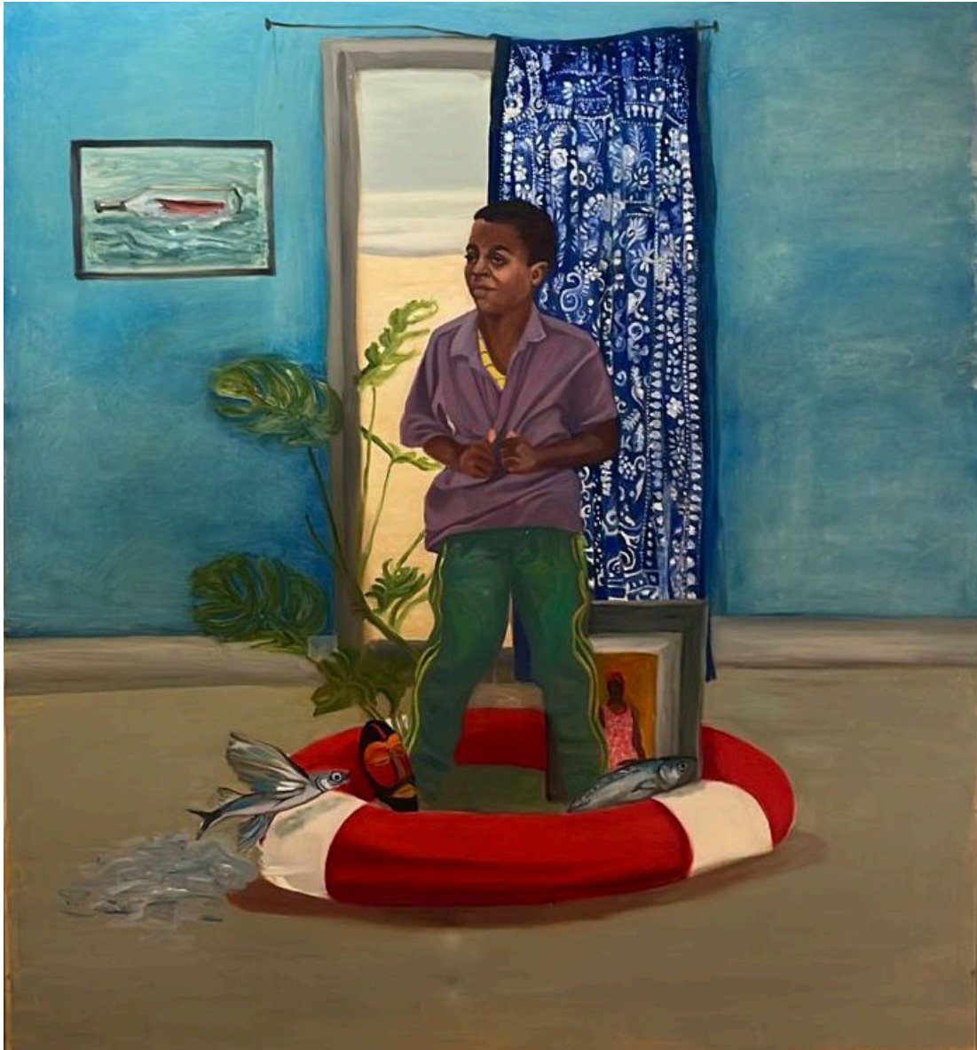
Amina Rezki, Untitled, 2023, Mixed media on canvas, 155 x 137 cm