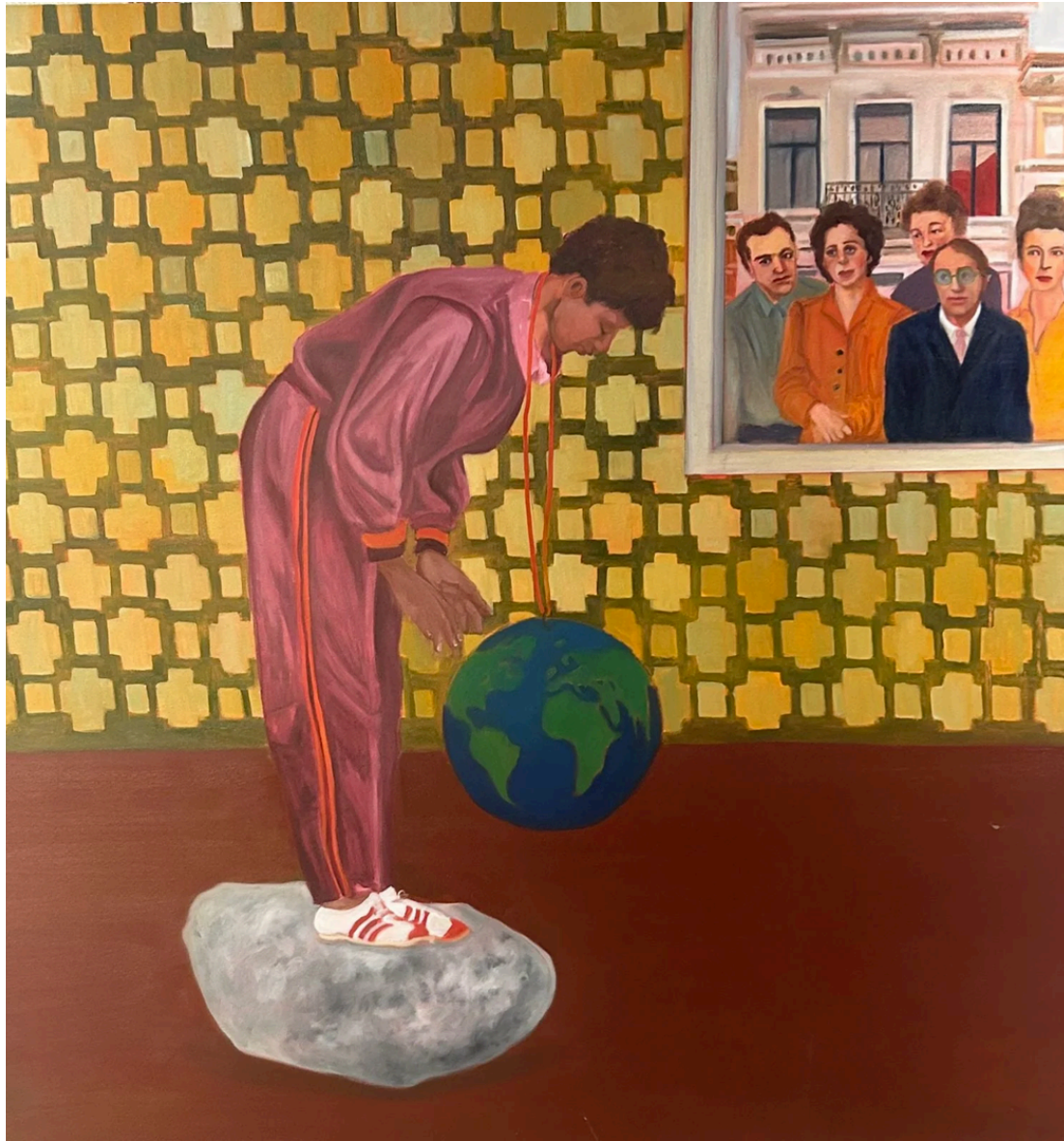
Amina Rezki, Untitled, 2024, Mixed media on canvas, 150 x 150 cm