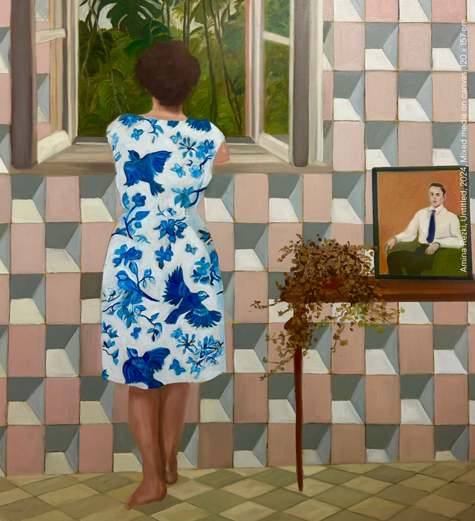
Amina Rezki, Untitled, 2024, Mixed media on canvas, 120 x 157 cm.