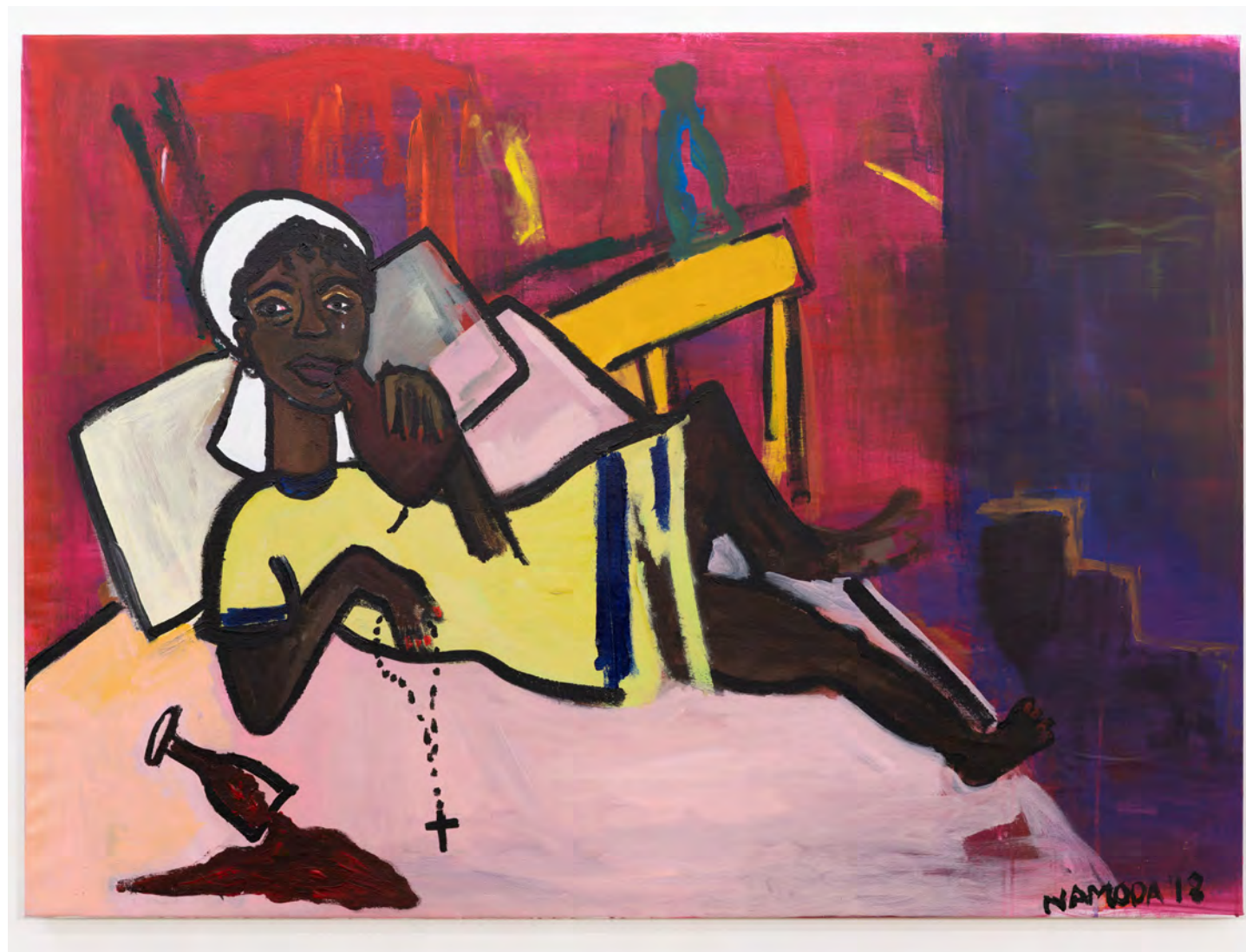
Maria's Ill Fate 2018 Oil and acrylic on canvas. 36 x 50 in. $6,000