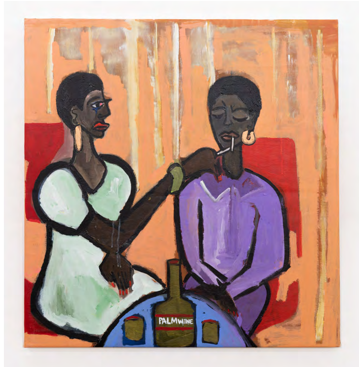
Sasha & Zamani 2018 Oil and acrylic on canvas. 40 x 38.5 in $6,000