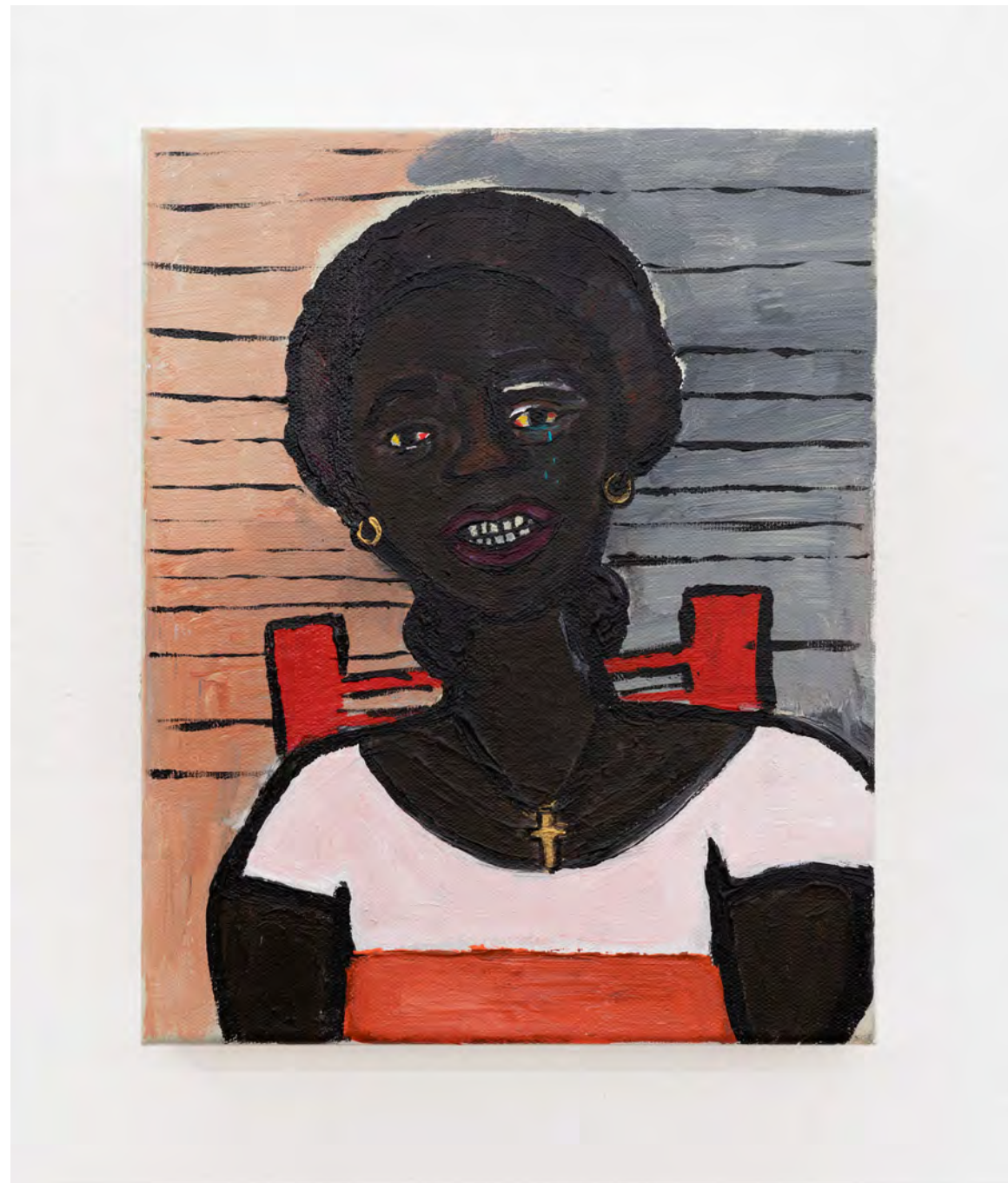
Cassi's Mae (Mother) 2018 Acrylic on canvas. 8 x 10 in $1,500