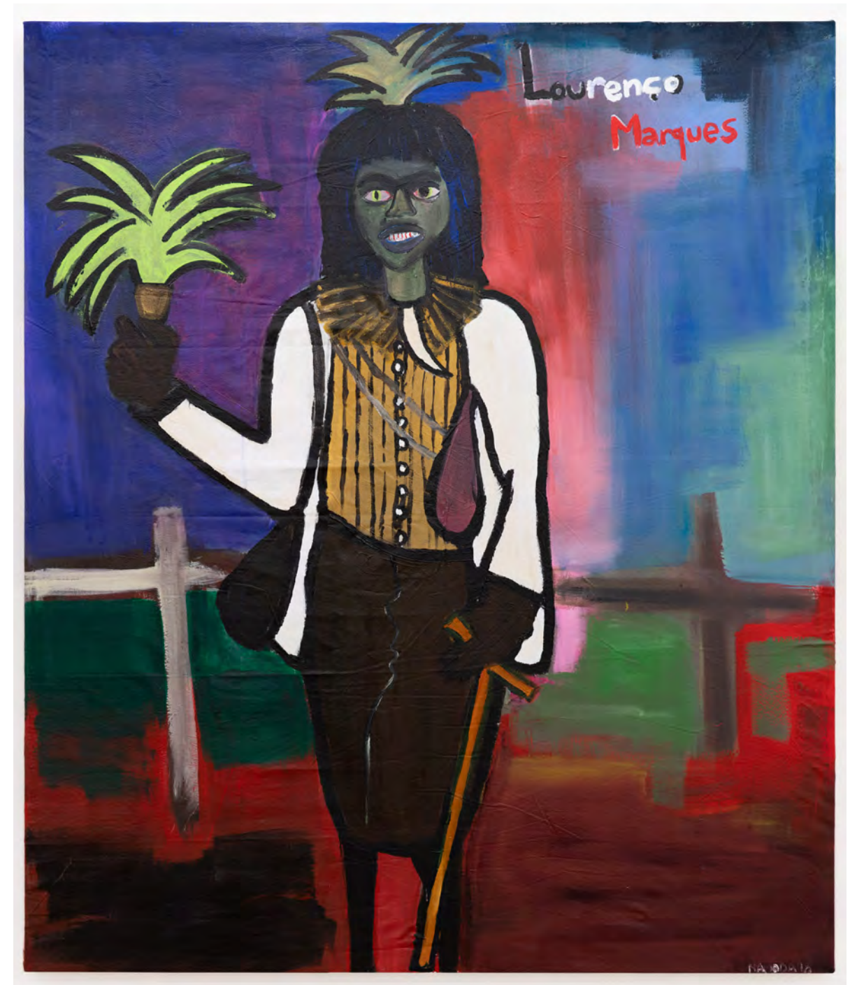
Medicine Man on a Visit to Laureço Marques 2018 Oil and acrylic on canvas. 57.5 x 48 in. $8,000