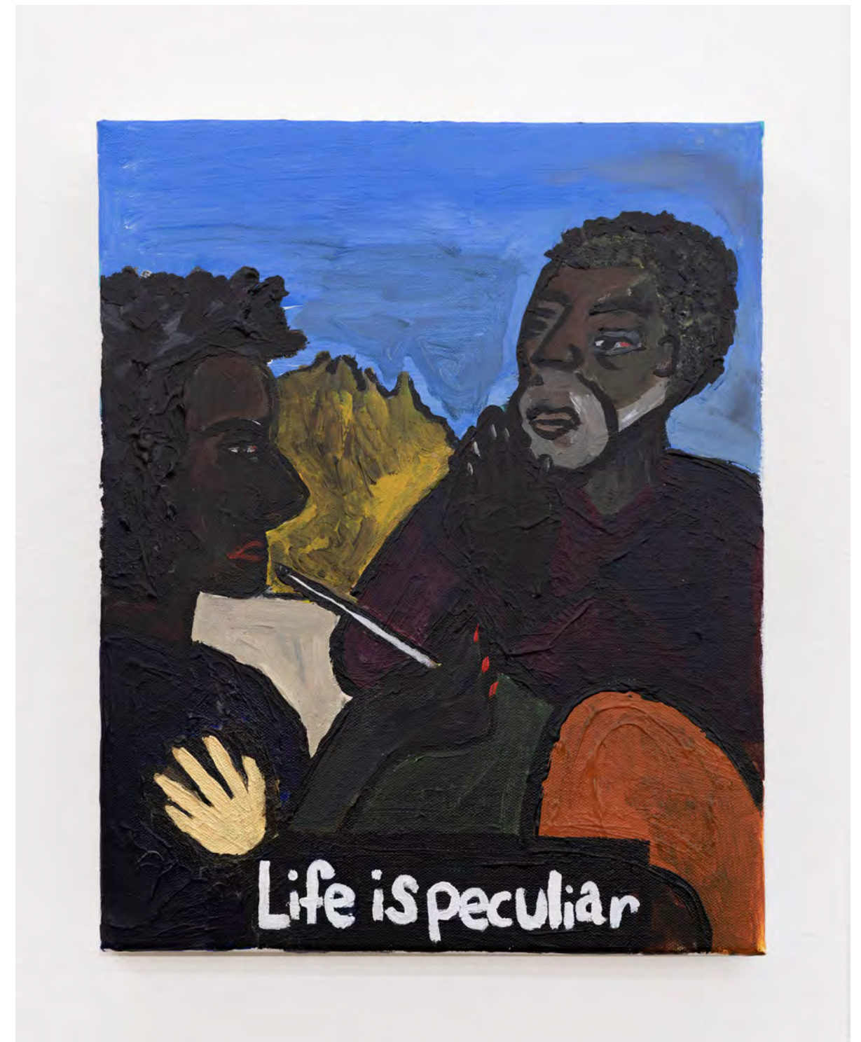
Afro Pessimism 2018 Acrylic on canvas. 11 x 14 in $3,000