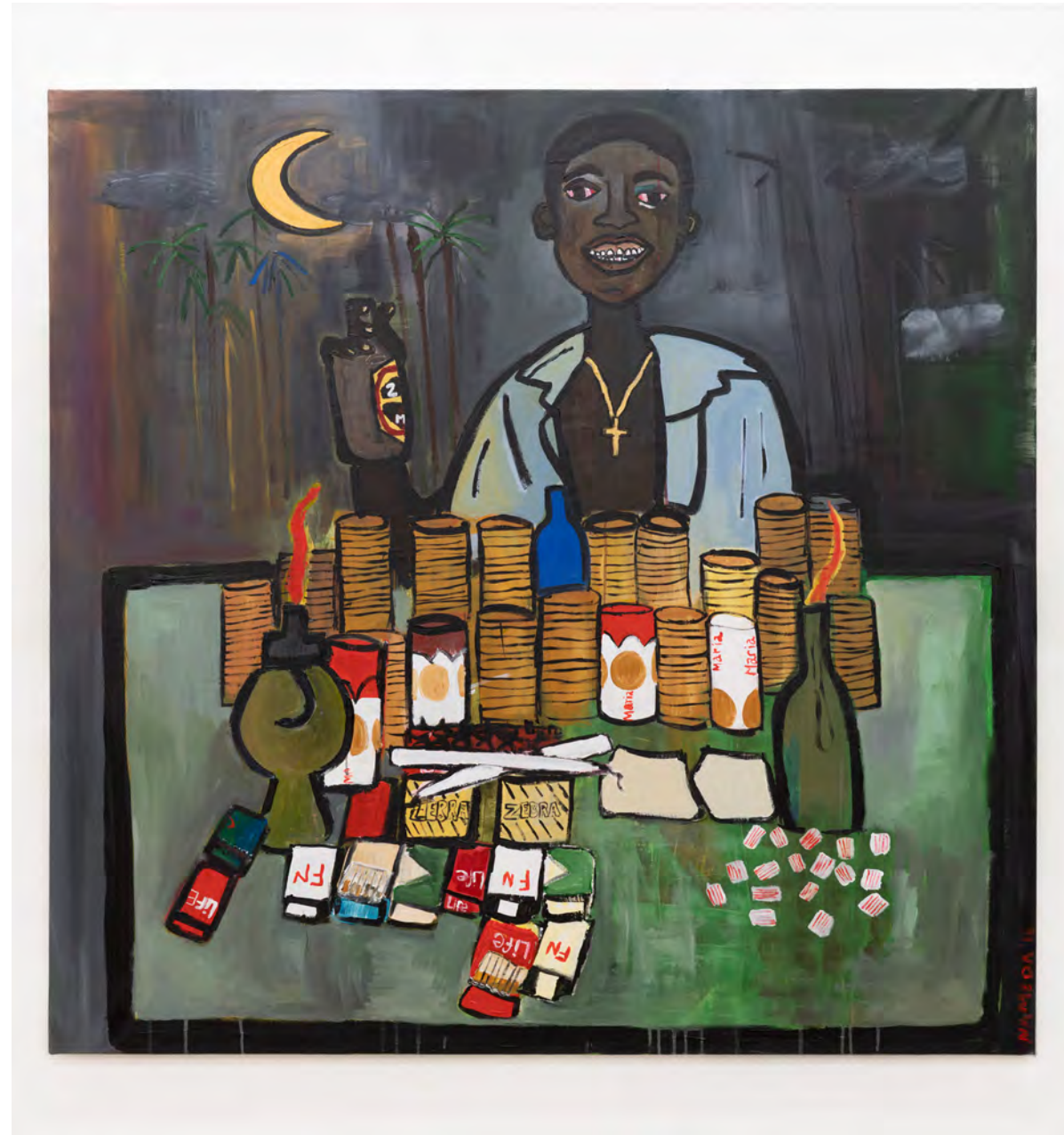
Goodnight Mercado Boy and Sad Headless Palm Trees 2018 Oil and acrylic on canvas. 56 x 58in. $9,000