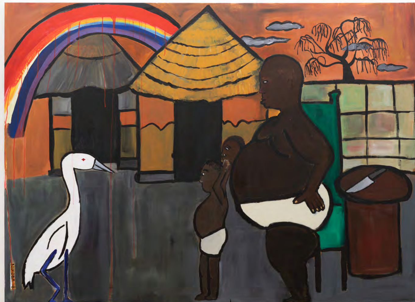
Outside the Witch Doctor's House 2018 Oil and acrylic on canvas. 61 x 85 in. $12,000