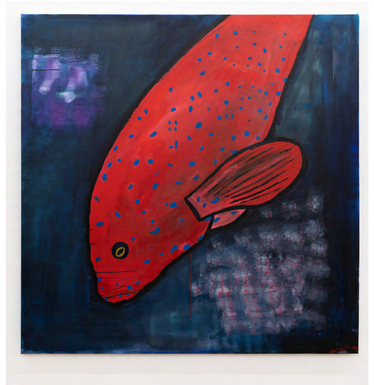
God is a Spirit 2018 Oil and acrylic on canvas. 53 x 53 in $6,000