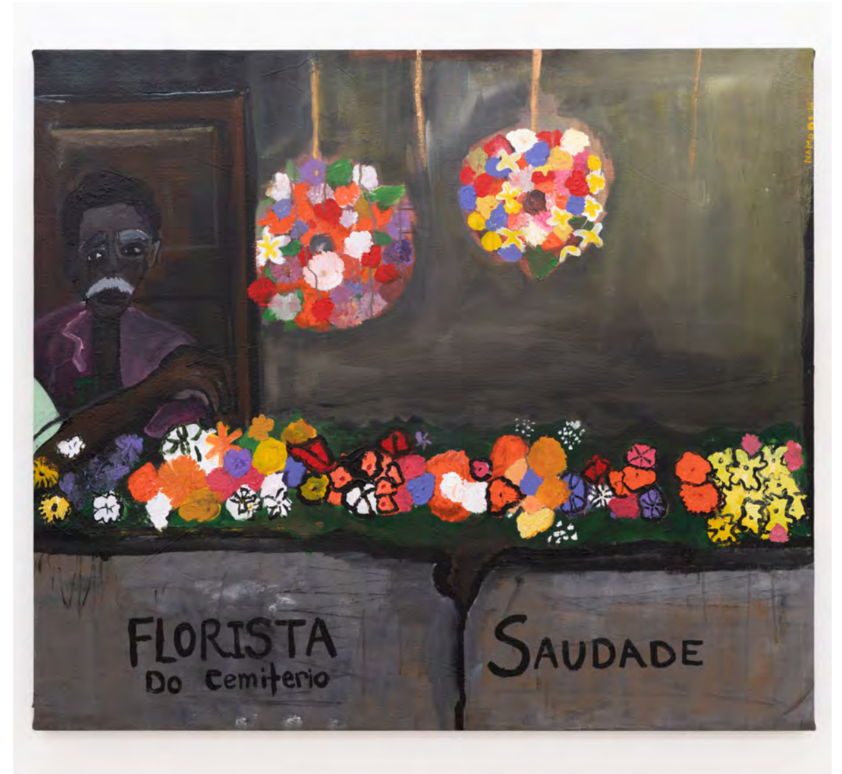
Florist of the Nostalgia Graveyard 2018 Oil and acrylic on canvas. 40.5 x 47.5 in. $8,000