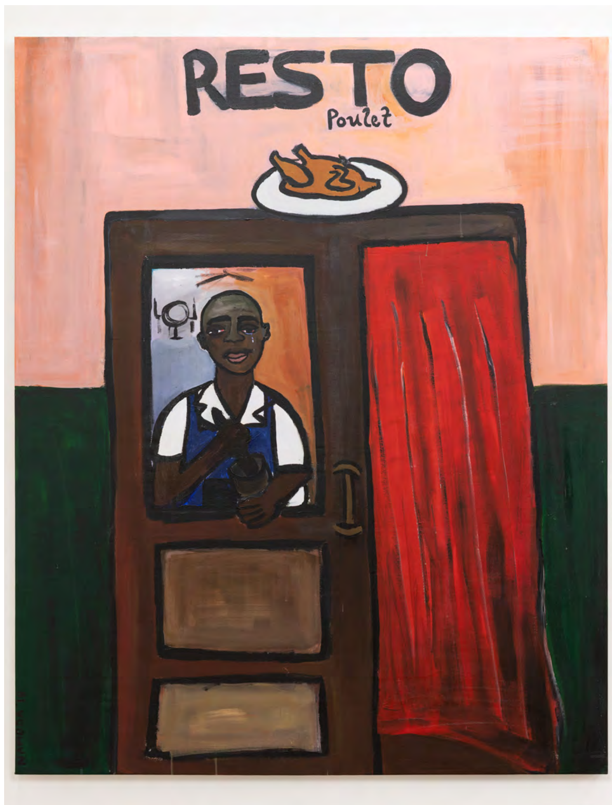
Papa Poulet Crying Over Mashed Chilies and the Nostalgia of Home 2018 Oil and acrylic on canvas 67.5 x 54.5 in. $10,000