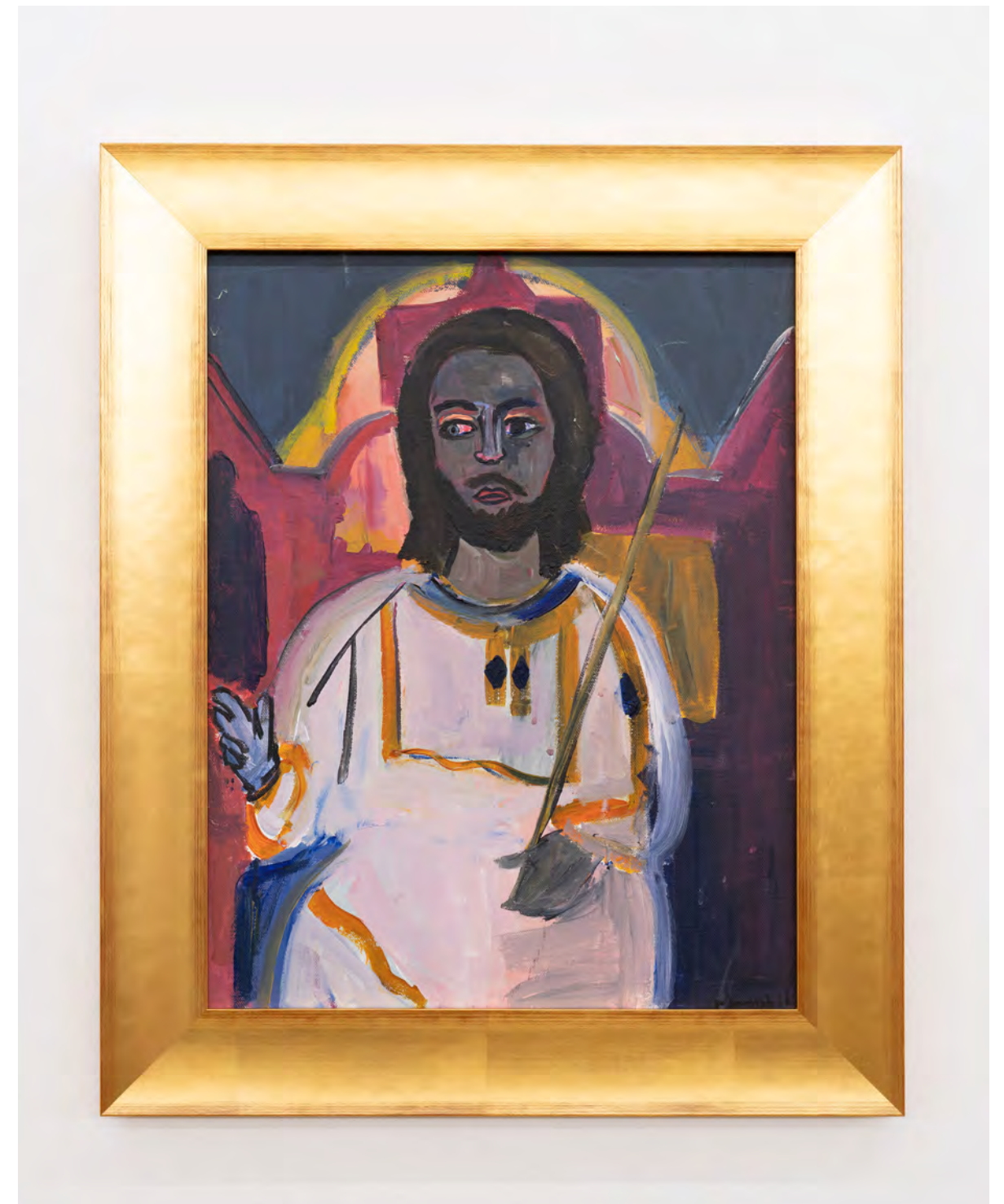
Godfather 2018 Acrylic on canvas. 18 x 14 in. NFS