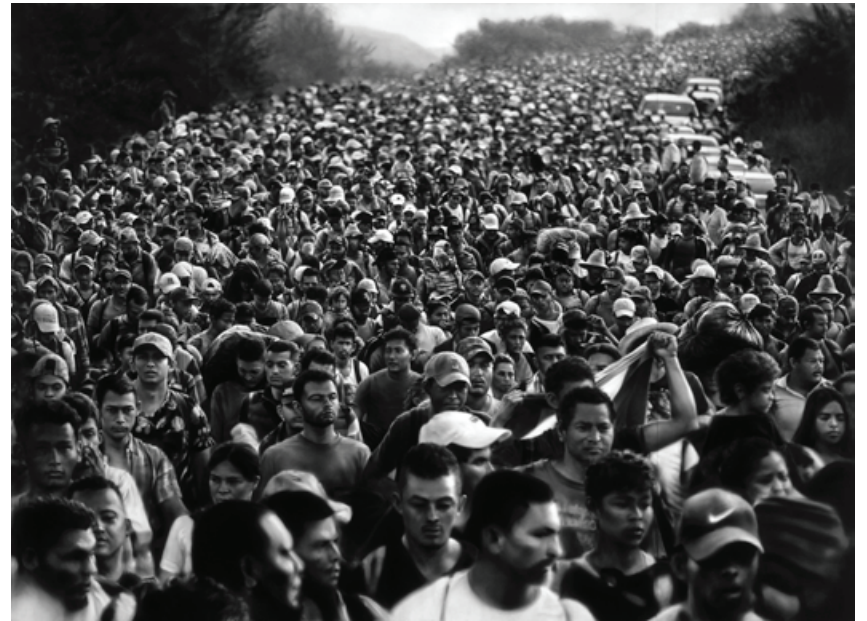
Untitled (Caravan; Arriaga, Mexico; October 27, 2018), 2019 charcoal on mounted paper image: 97 x 132 inches; 246.4 x 335.3 cm frame: 102 7/8 x 137 7/8 inches; 261.3 x 350.2 cm