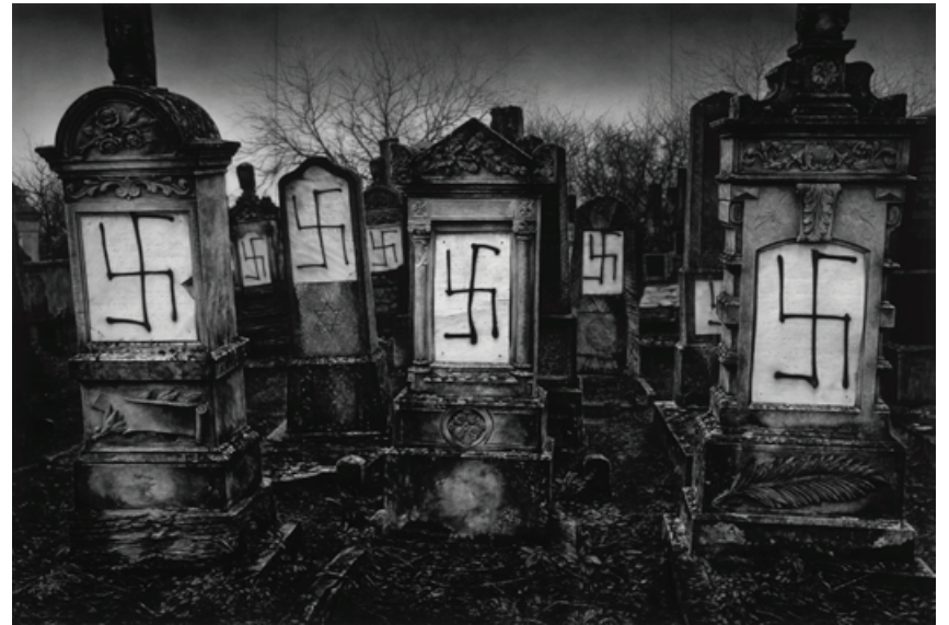
Untitled (Defaced Jewish Cemetery; Strasbourg, France; December 14, 2018), 2019 charcoal on mounted paper image: 96 x 144 inches; 243.8 x 365.8 cm frame: 101 7/8 x 149 7/8 inches; 258.8 x 380.7 cm