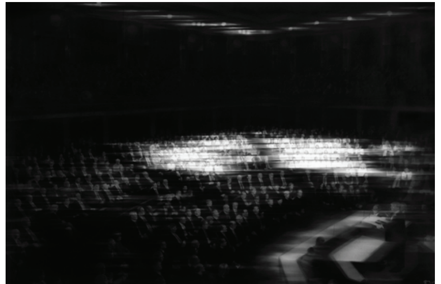
Untitled (State of the Union; Washington, D.C., USA; February 5, 2019), 2019 charcoal on mounted paper image: 96 x 146 inches; 243.8 x 370.8 cm frame: 101 7/8 x 151 7/8 inches; 258.8 x 385.8 cm