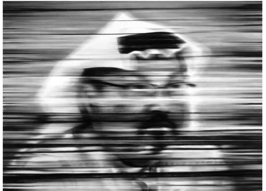
Untitled (Jamal Ahmad Khashoggi; Istanbul, Turkey; October 2, 2018), 2019 charcoal on mounted paper image: 87 1/2 x 120 inches; 222.3 x 304.8 cm frame: 93 3/8 x 125 7/8 inches; 237.2 x 319.7 cm