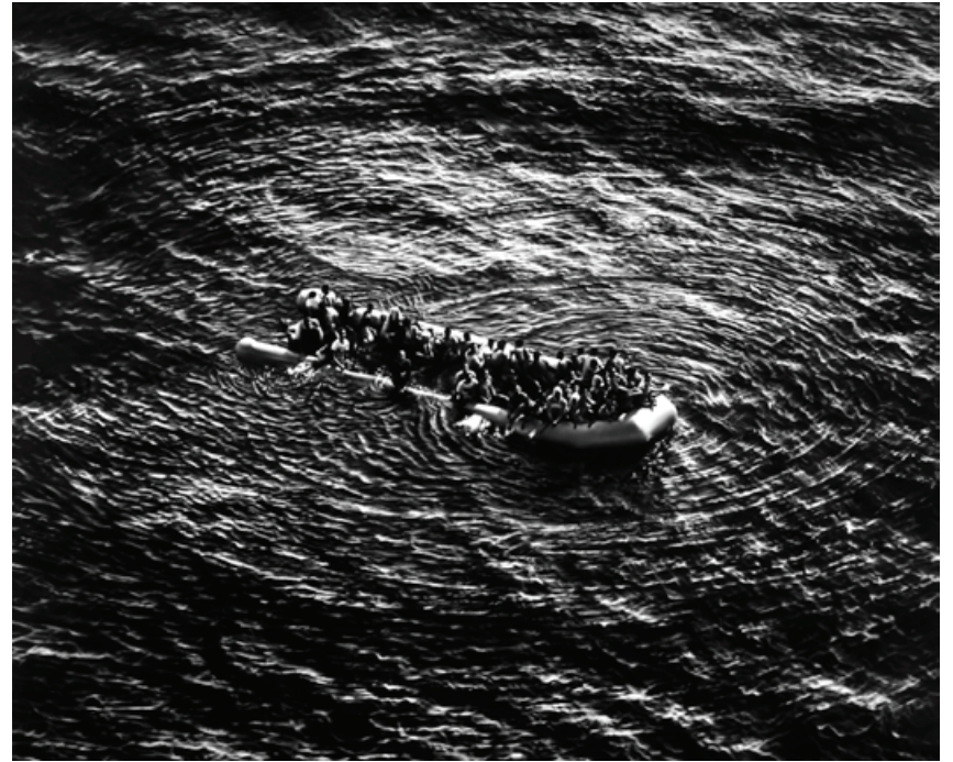
Untitled (Refugees Moonbird Sighting, Mediterranean Sea; May 5, 2017), 2019 charcoal on mounted paper image: 97 x 120 inches; 246.4 x 304.8 cm frame: 102 7/8 x 125 7/8 inches; 261.3 x 319.7 cm