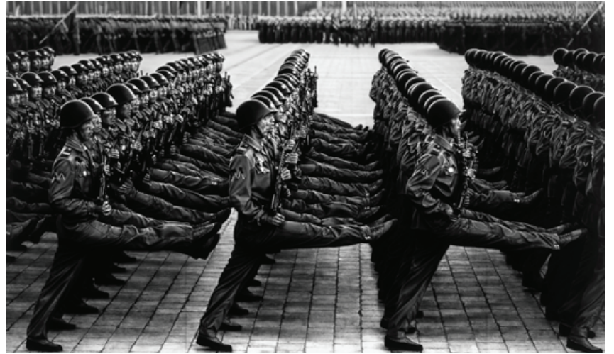
Untitled (Marching Soldiers; (Party Foundation Day) Pyongyang, North Korea; October 10, 2015), 2019 charcoal on mounted paper image: 81 1/2 x 140 inches; 207 x 355.6 cm frame: 87 3/8 x 145 7/8 inches; 221.9 x 370.5 cm