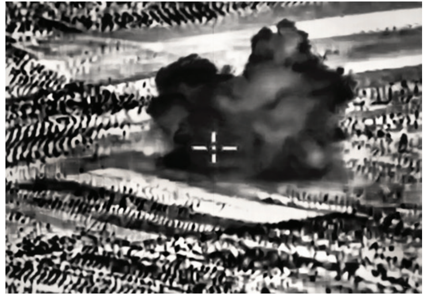
Untitled (Russian Air Strike; Syria, 2015), 2017 charcoal on mounted paper image: 97 x 140 1/16 inches; 246.4 x 355.8 cm frame: 102 5/8 x 145 7/8 inches; 260.7 x 370.5 cm