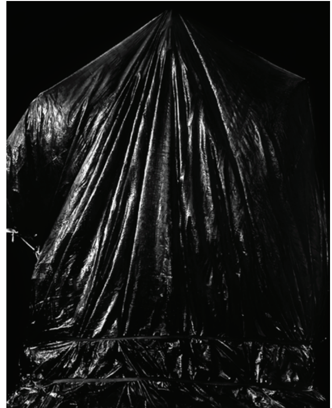
Untitled (Statue of Confederate General Robert E. Lee Covered; Charlottesville, Virginia; August 12, 2017), 2018 charcoal on mounted paper image: 120 x 95 1/4 inches; 304.8 x 241.9 cm framed: 125 1/4 x 100 1/2 inches; 318.1 x 255.3 cm