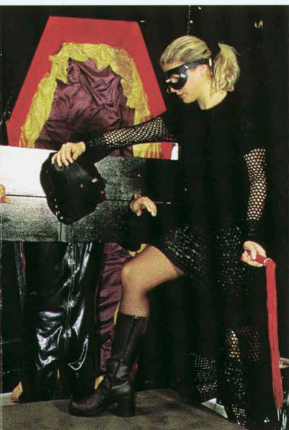
CREATE PROBLEMS 1999 COLOR PHOTOGRAPH

these interviews. Departing from conventional documentary form, none of the interviewees appear on camera. Rather, all the participants are played by children between the ages of seven and ten. Hence, The Matrix Effect – a supernatural transformation whereby commitment to new art and ideas stimulates a radical age reversal. Eternal youth is not the only “Matrix effect.” Surprising transformations occur as the sophisticated concepts and language of the artists are interpreted and spoken by the children. It is important to note that the performers, who are not professional