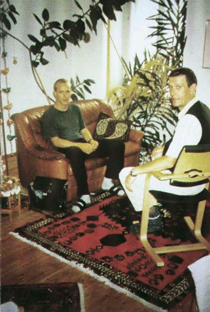
DESPERATELY SEEKING ARTWORK 1997