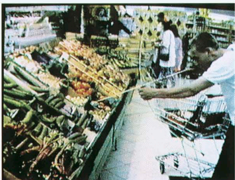
THE HUNT 1992 VIDEO STILL

these interviews. Departing from conventional documentary form, none of the interviewees appear on camera. Rather, all the participants are played by children between the ages of seven and ten. Hence, The Matrix Effect – a supernatural transformation whereby commitment to new art and ideas stimulates a radical age reversal. Eternal youth is not the only “Matrix effect.” Surprising transformations occur as the sophisticated concepts and language of the artists are interpreted and spoken by the children. It is important to note that the performers, who are not professional