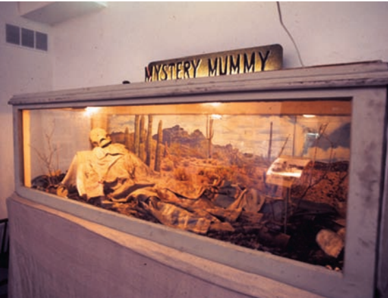
STOREFRONT INSTALLATION FROM THE TRAVELING MYSTERY MUSEUM , VENICE, CALIFORNIA, 1973