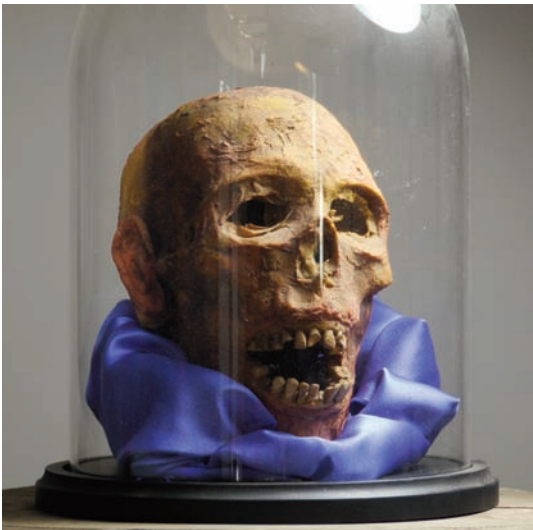
FRAGMENT OF THE MYSTERY MUMMY , 1973