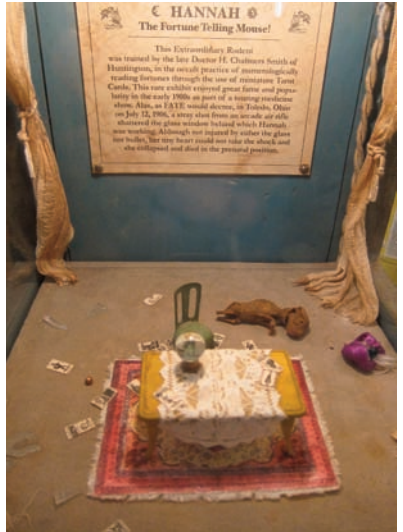
HANNAH THE FORTUNE TELLING MOUSE, 1969/2014 (DETAIL)