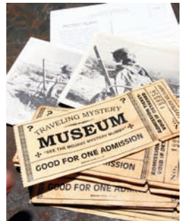
PAPER EPHEMERA FROM THE TRAVELING MYSTERY MUSEUM , 1973