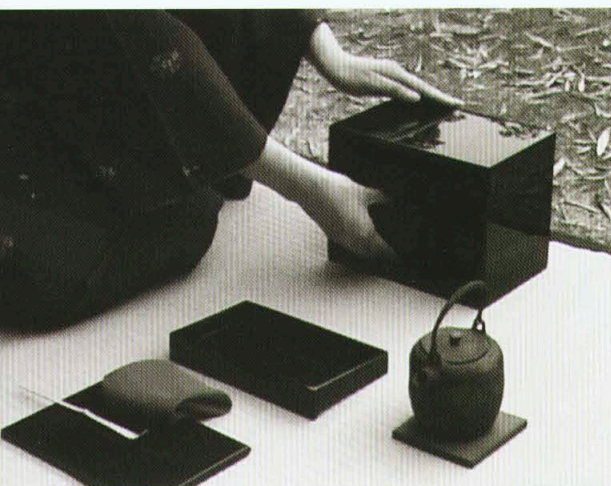
Top: Installation view, Black Caddy , 2004