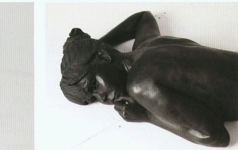
Installation view (detail), Reclining Figure , 2005

The third and final work featured in MATRIX 155 is Black Caddy (2004). In this small video installation, Hosking documents the meticulous fabrication of a black lacquer tea caddy. Once complete, the caddy is transported to Kyoto, where it is used in a traditional Japanese tea ceremony. As in previous works, the tea caddy is displayed alongside the video of its creation. Here again the process of making an object takes on a kind of ceremonial, almost religious significance. Like the tea ceremony itself, the creation of the caddy becomes a ritual of patience and repetition. This unexpected meditation on Japanese culture becomes a means of escape from the pace of contemporary life. And just as the Romantic artists sought refuge in the mountains of England's Lake District and the exotic markets of the Orient, so too are we transported to an exotic and foreign continent.