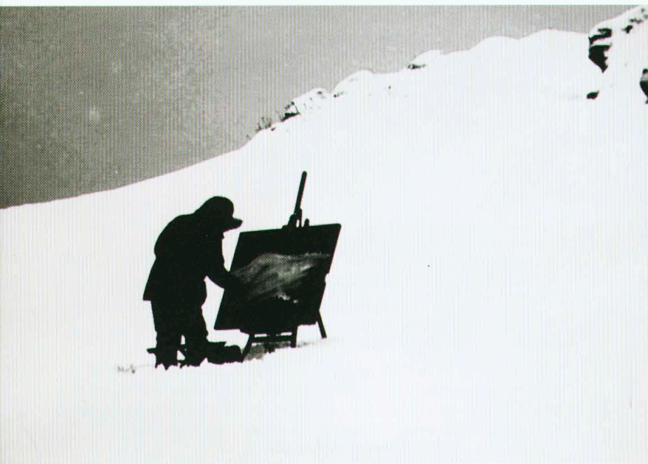
Top: Video still, Night Painting , 2004 • Bottom: Video still, Snow Painting Once Removed , 2005