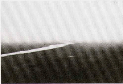
Little Landscape at the Seaside ( Kleine Landschaft am Meer ), oil on canvas, 1969

stemming from photographic "mistakes" - the out-of-focus image, the blur, the accidental or awkward snapshot detail - to comment on the artistic choices being made about what reality to present. The small details of implied larger views ( Candle , 1982; Administrative Building , 1964) suggest that Richter chose them because they have some privileged position within the larger view, yet they stubbornly refuse to divulge any more information than the purely painterly quality of the surface.