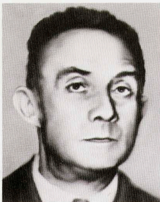
Portrait of Henry de Montherland, oil on canvas, 1971

though the figure still exerts a demanding presence. And the close-up detail and cropping in Tubes (1967), while depicting the shining cylindrical forms virtually diagrammatically, ultimately present merely abstract pattern on the surface.