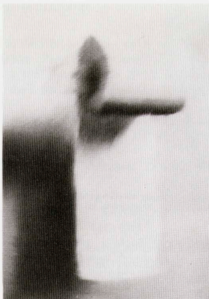
Loo Paper (Klorolle) , oil on canvas, 1965

work. As subjects they are important because they suggest personal histories and age-old traditions which here seem to be fading from consciousness regardless of how much we wish to retain our heritage and memories. While we are left with an intriguing painting as a work of art, we are also left with a nagging suspicion that we have lost something or that our perceptual abilities have been dulled beyond repair, perhaps from the very glut of media images from which Richter himself finds his non-subjects.