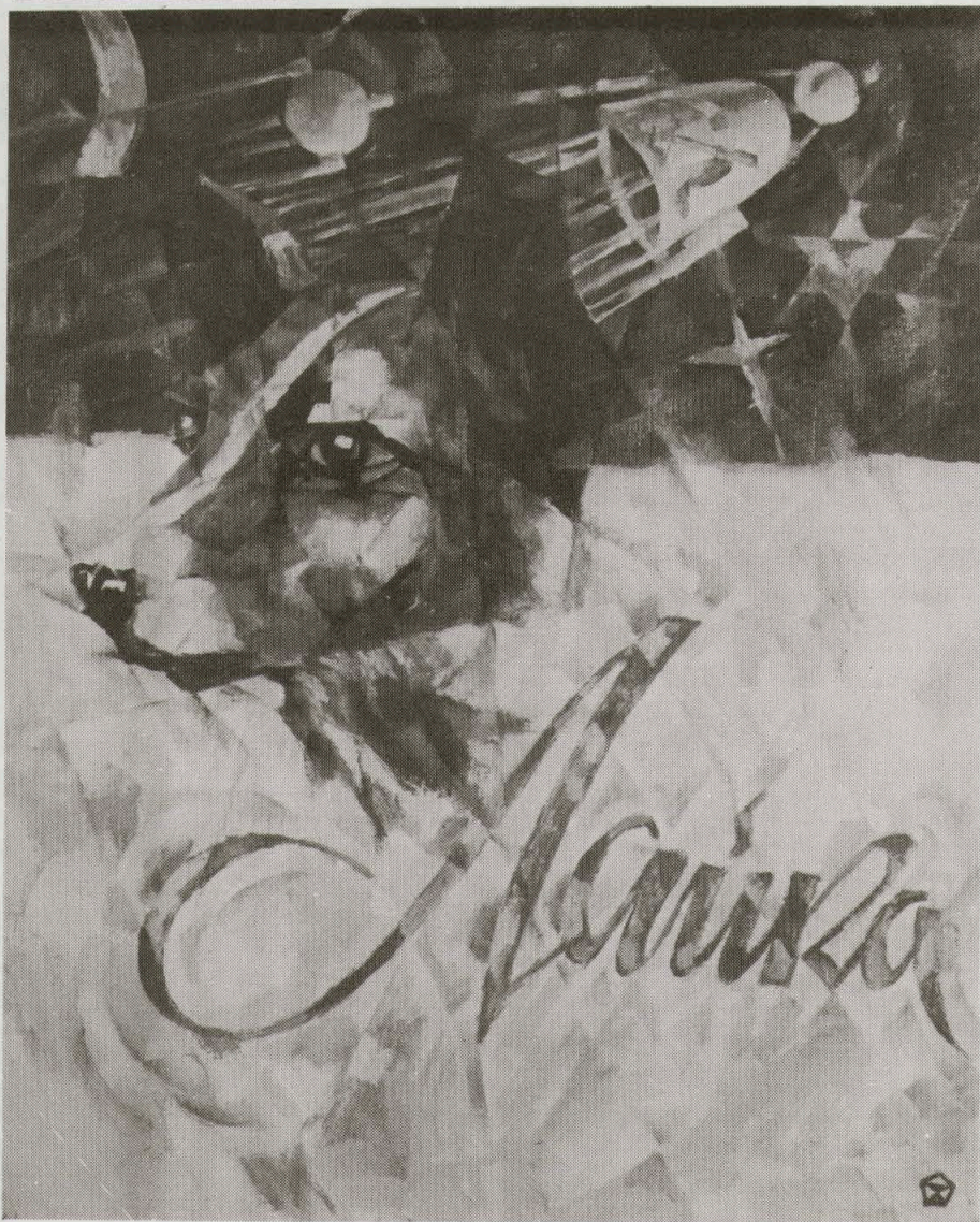
Laika Cigarette Box, 1972