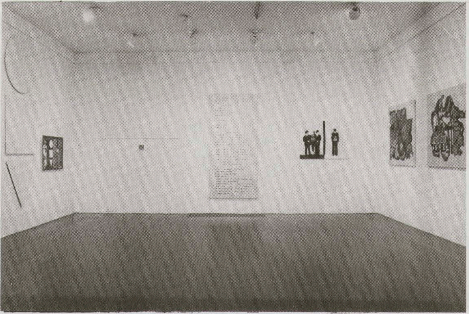
Installation, Ronald Feldman gallery, New York 1976

position Passport mentioned earlier. Color Writing: Ideological Abstraction No. 1 (1974-75) appears at first glance to be an abstract painting and as such would be an anathema to Soviet authorities. The work passed by Soviet customs officials, declared as a tablecloth. Ironically the pretty daubs of color are simply a code for the text of Article 129 of the Constitution of the Russian Federal Republic, which guarantees freedom of speech, religion and the press. Each color corresponds to a letter in the Russian alphabet.