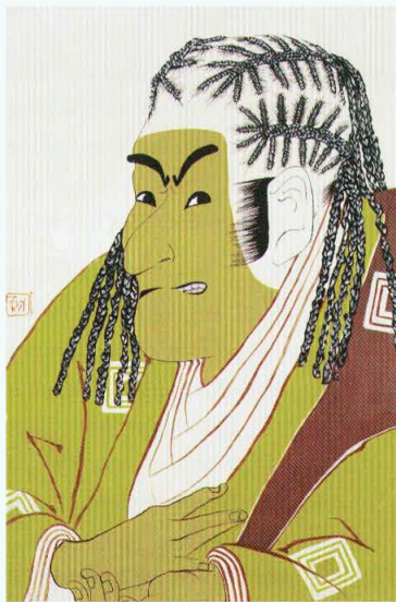
a 1 blackface #36, 2002. Acrylic on panel.

1991–B.S. Kinesiological Sciences, University of Maryland, College Park, Maryland