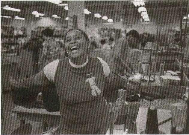
From Family Pictures and Stories, Mom at Work , 1979-80

Alternative Space Gallery, San Diego, CA Family Pictures and Stories: A Photographic Installation '84; Hampshire College Art Gallery, Amherst, MA '87; Rhode Island School of Design, Providence, RI '89; CEPA Gallery, Buffalo, NY Calling Out My Name '90; P.P.O.W, NYC '90; The New Museum of Contemporary Art, NYC And 22 Million Very Tired And Very Angry People '91.